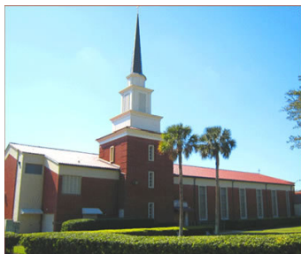
St. Matthew's Catholic Church 1773 Blanding Blvd, Jacksonville, FL Phone: 904-388-8698